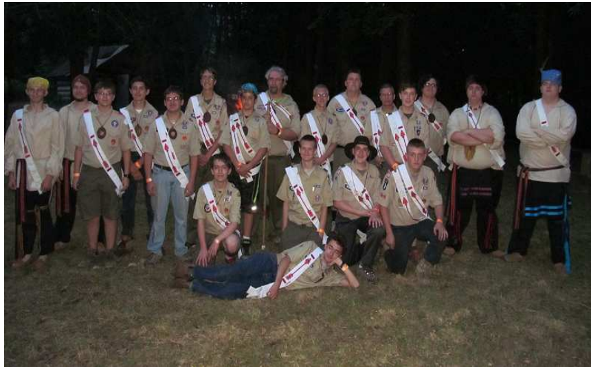
Come out to one of our last two Ordeals this summer and join in the fun.