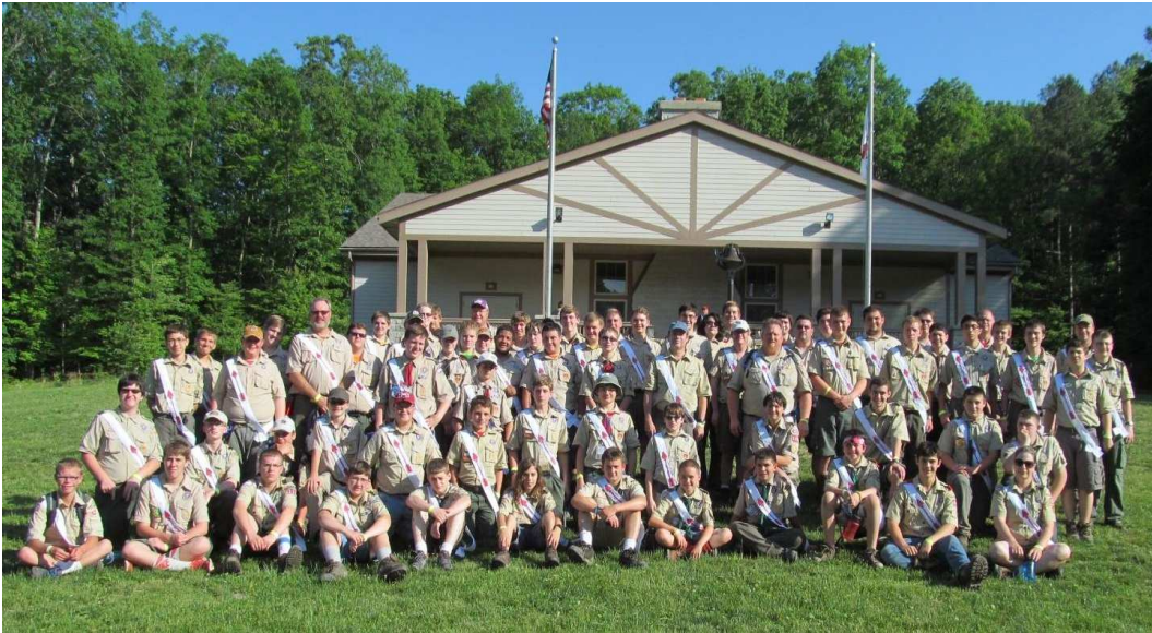
Ordeal/Brotherhood Weekend at Chief Logan Reservation May 30, 2015 Please congratulate our 76 new Ordeal members and 16 new Brotherhood members.