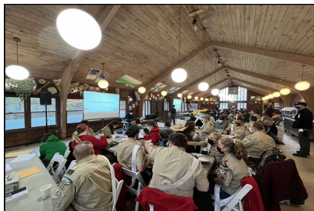
Section E13 2021 Forum