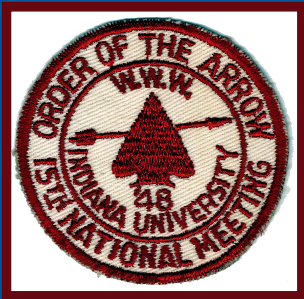
1948 NOAC Staff Patch

The first National Order of the Arrow Conference, or NOAC, was held in 1948 at the University of Indiana in Bloomington. The event was officially called the 15 th National Meeting, and was only later called the first NOAC when that name was adopted for future national gatherings. Before that time, the national meetings were intended only for lodge and national leaders. The 1948 NOAC was the first time that Arrowmen of all levels from across the nation came together. Since then, NOAC has been held every two to three years, always on a university campus.