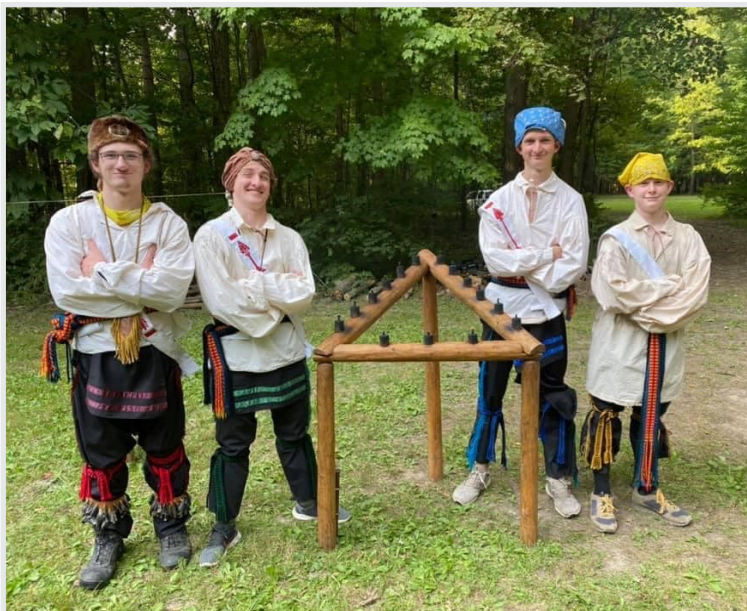
2021 Lazarus Ordeal Ritual Team

For the new ritual team and set up of the ordeal teams, we need a lot of interested people. This is a combined effort among the lodge, and with the new system we're implementing in ritual we can have people with varying levels of interest and experience. For dates, we are considering the first Saturday of the month beginning in March. This is dependent on the availability of participants and could change, but based on schedules currently this is the best way to have 2 practices previous to the beginning of the season and also during the ordeal season. Thank you, feel free to ask me any questions through my email on the lodge website, or ask me in person at our LLD.